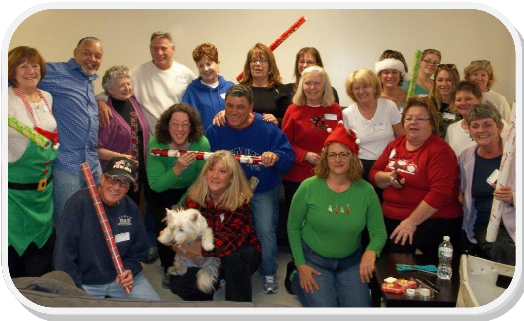
Volunteers gathered for the annual Wrap 'n Yap to wrap Holiday Gifts for CODI Consumers

The holiday celebrations are just one example of the incredible commitment